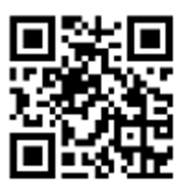
*This particular QR code takes you to driver training for Onsite